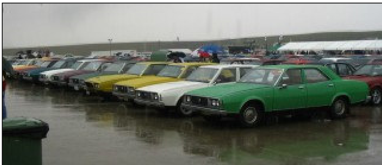
P76s at the Australian Muscle Car Masters, 30 October.

Canberra and Districts Leyland P76 Club Newsletter November 2005